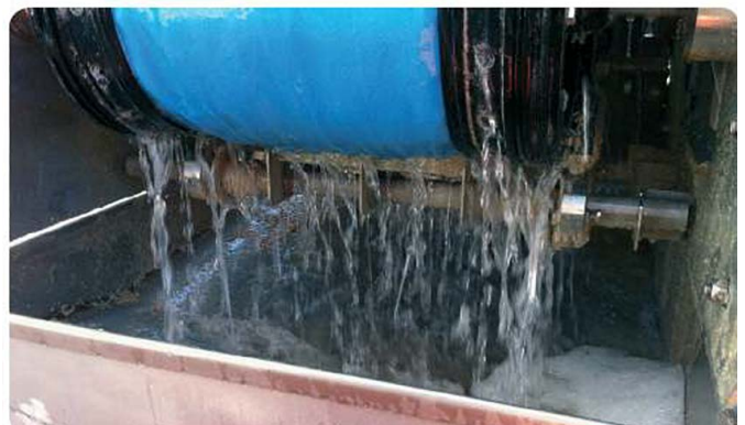
Fig 3. Bulk de-watering section of the Z300A.