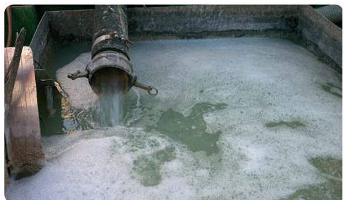
Fig 2. Filtrate being discharged from the Z300A unit.